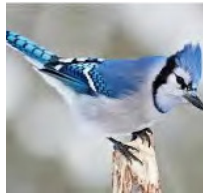
BLUE JAY OR BLUEBIRD