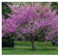
TREE WITH FLOWERS