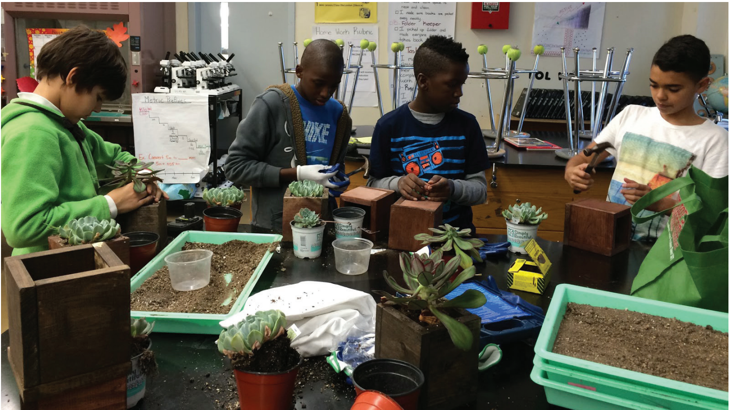
Students building planters and planting succulents as a school fundraiser.

succulents were being sold for $30 or more and were sowed in tiny recycled wood boxes. I thought to myself, “We could do that!”