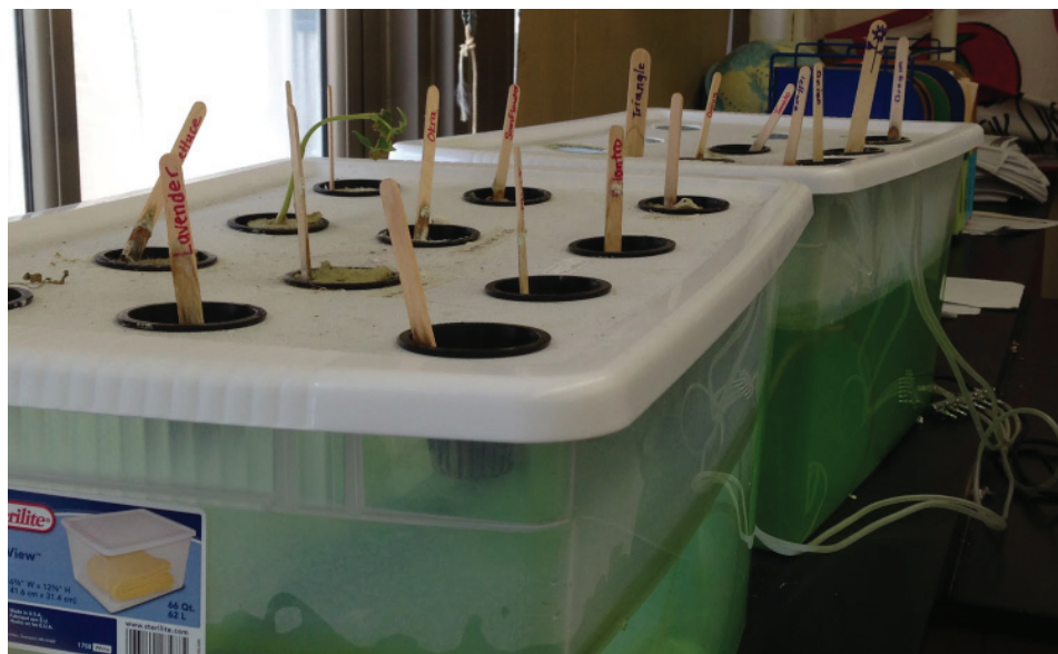
Our aeroponic system: What can be learned from “unsuccessful” experiences?

Soon it was warm enough to begin planting outside again. With some